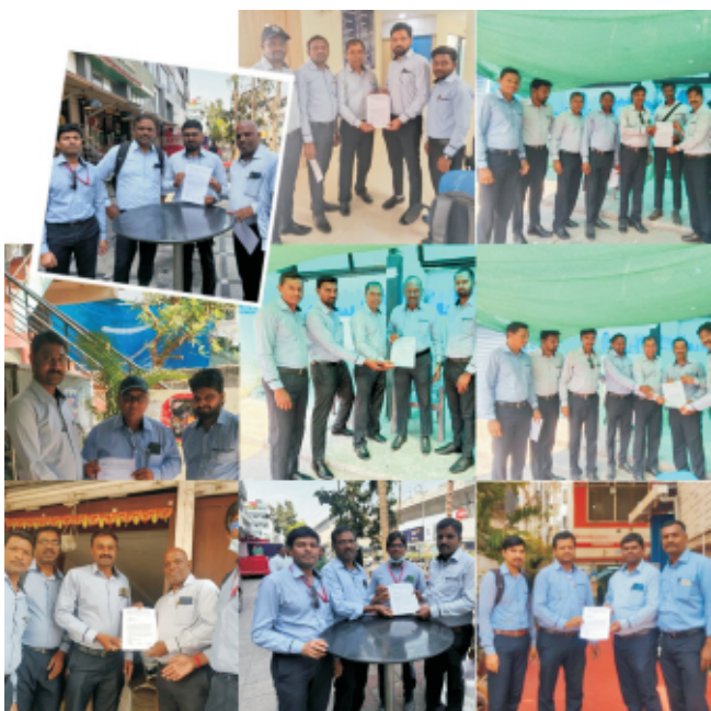
Kukatpally & Karimnagar