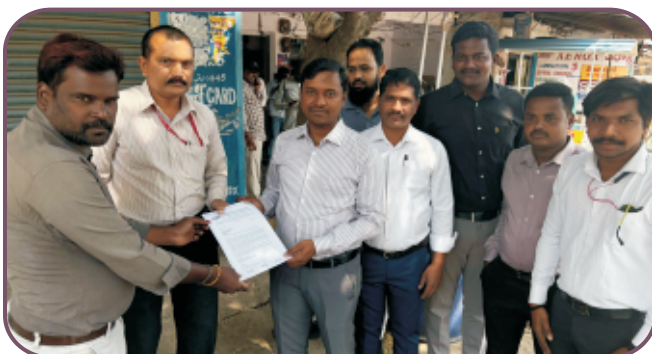
Memorandum submitted to RSM Alkem Diabetic Division - Mahabubnagar