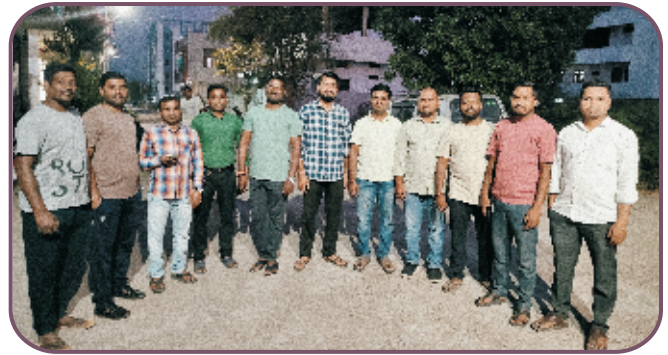
Working Committee Meeting - Warangal