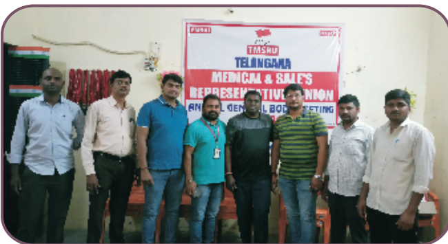
Working Committee Meeting - Warangal