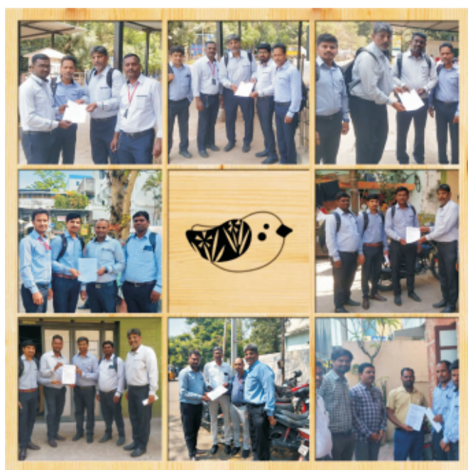
Hyderabad, Secunderabad & Nizamabad