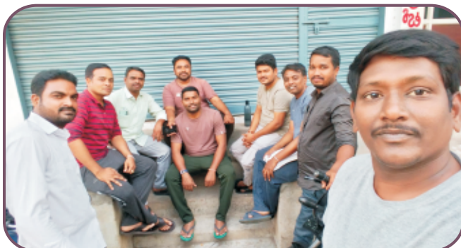
Working Committee Meeting - Jagtial