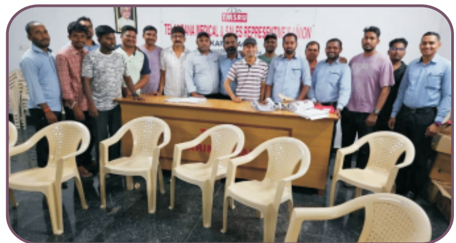
Torrent Subunit Council Meeting - Karimnagar