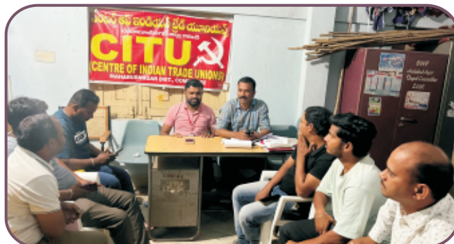
Working Committee Meeting - Mahabubnagar