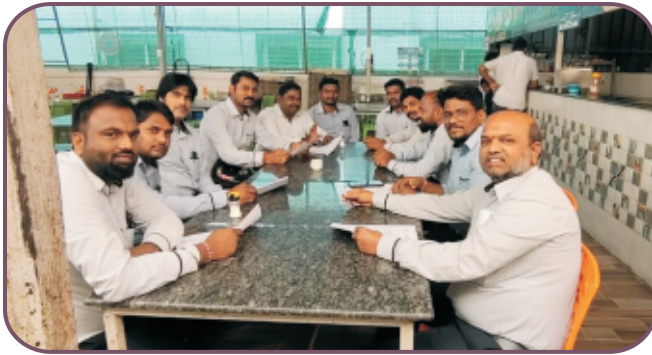
Torrent Subunit Council Meeting - Warangal