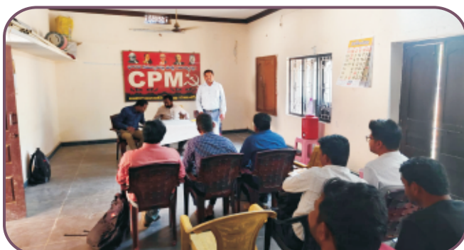
General Body Meeting - Adilabad