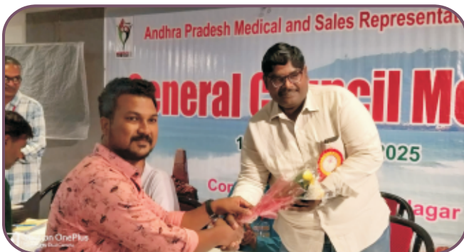
General Secretary, TMSRU Attending APMSRU General Council Meeting - Vishakapatnam