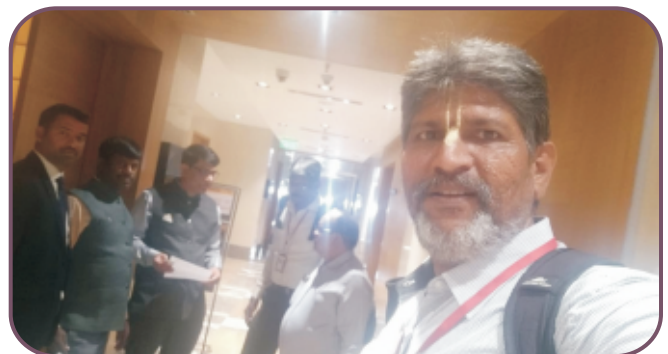
Strike Notice submitted to Marketing Manager, Alkem - Hyderabad