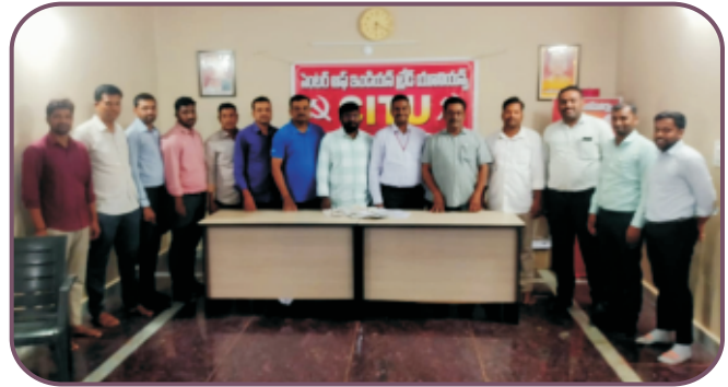
Annual General Body Meeting - Siddipet