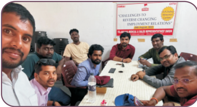
Working Committee Meeting - Mancherial