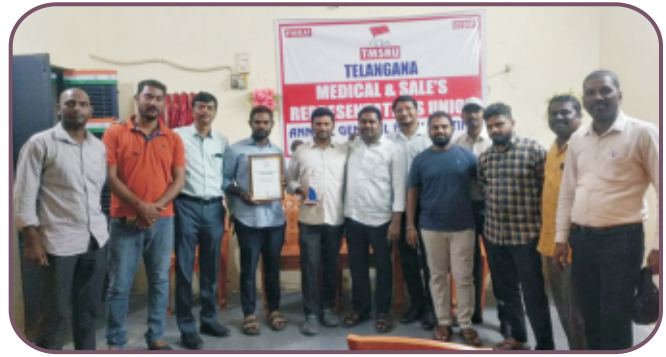
Working Committee Meeting - Jagtial