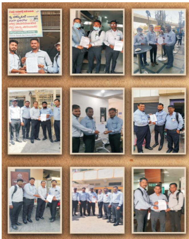
Karimnagar & Warangal