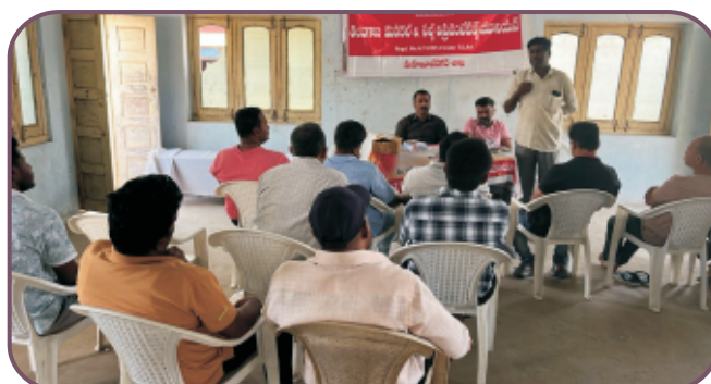
General Body Meeting - Mahabubnagar