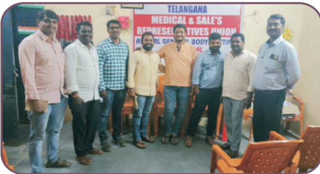
Office Bearers Meeting - Warangal