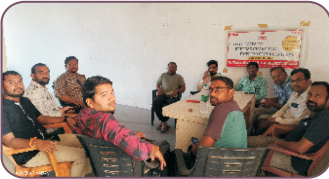
Working Committee Meeting - Mancherial