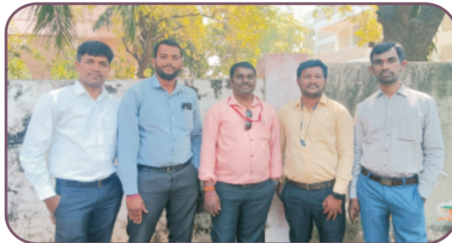
Alkem Subunit Council Meeting - Warangal