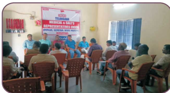
General Body Meeting - Warangal