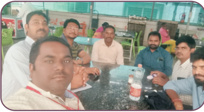
Office Bearers Meeting - Warangal