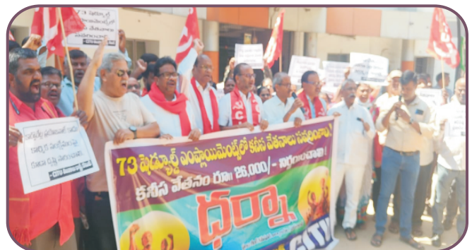
Demonstration conducted before Commissioner of Labour Office, Hyderabad, demanding Final Notification for Minimum Wages