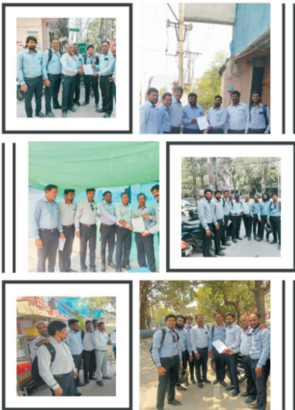
Hyderabad & Kukatpally