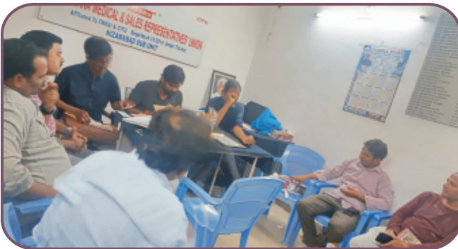
Working Committee Meeting - Nizamabad