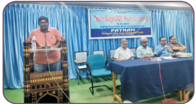
General Secretary, TMSRU addressing in Seminar on Central Budget 2025