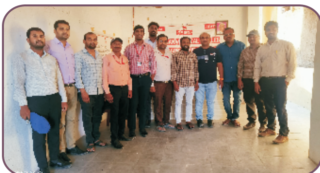
Base level functioning training class - Mancherla