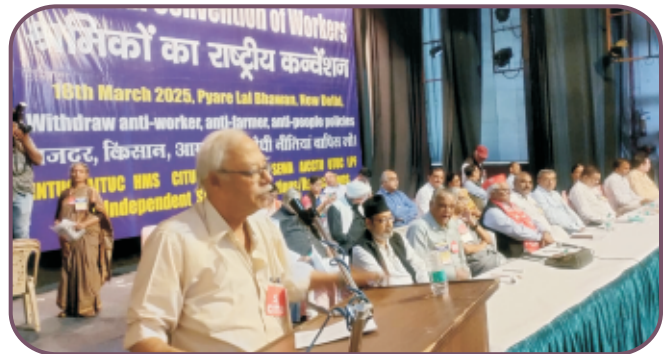
Com. Tapan Sen, General Secretary, CITU addressing the National Convention of Workers - Delhi