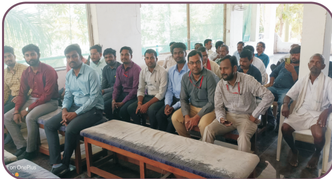
Seminar against labour codes by CITU - Mancherla