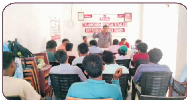
General Body Meeting - Mancherla