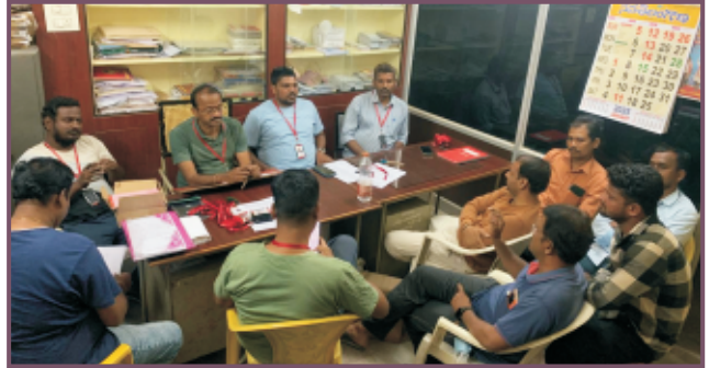
Working Committee Meeting - Nalgonda