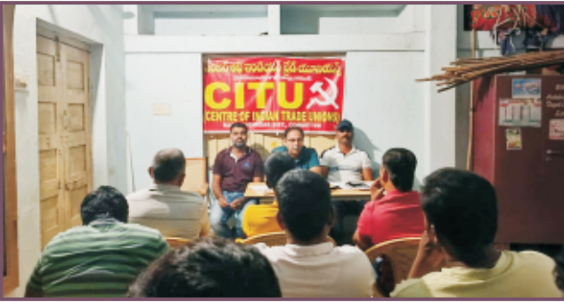
Base Level Functioning Training Classes - Mahabubnagar