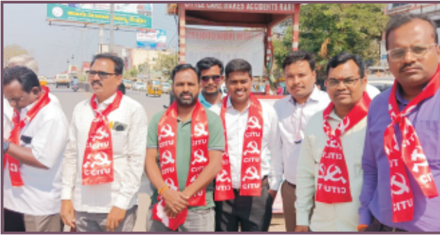
Protesting against Budget 2025 along with CITU - Mancherial