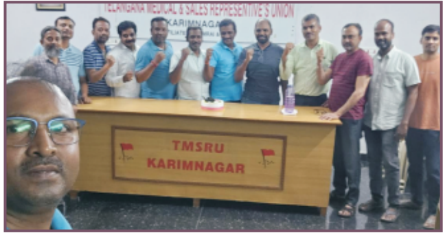
1000+ Membership Achievement Celebrations - Karimnagar