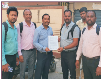
Torrent Memorandum Submission - Nizamabad