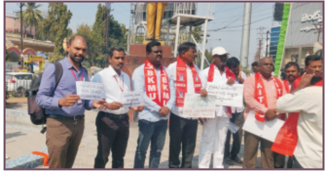
Protesting against Budget 2025 along with CITU - Karimnagar