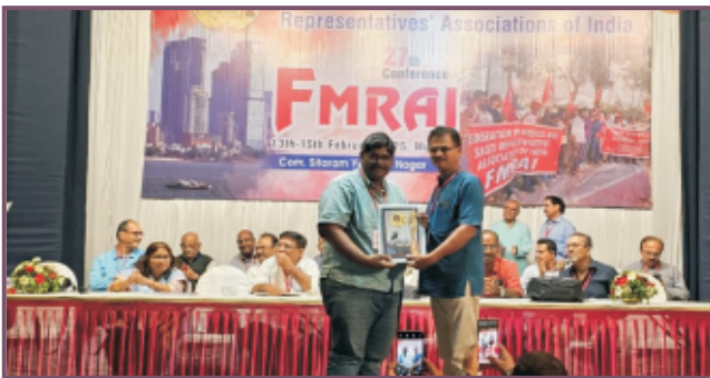
Felicitation to General Secretary, TMSRU by Reception committee