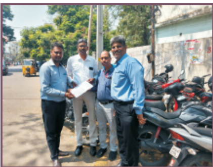
Torrent Memorandum Submission - Secunderabad