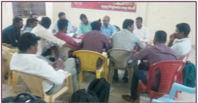
Working Committee Meeting - Kotthagudem