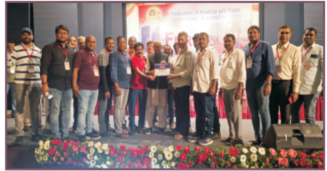
Karimnagar felicitated on achievement of 1000 memberships 2024