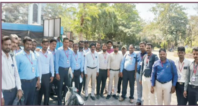
Karimnagar Subunit given Representation to the management of Prathima Institute of Medical Sciences regarding Doctor Calls.