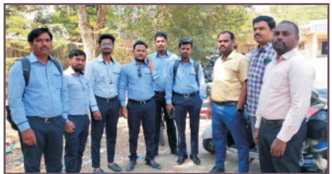
Torrent Subunit Council Meeting - Nizamabad