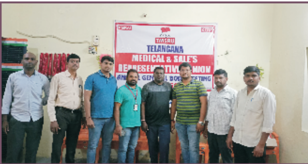
Branch Working Committee Meeting - Warangal