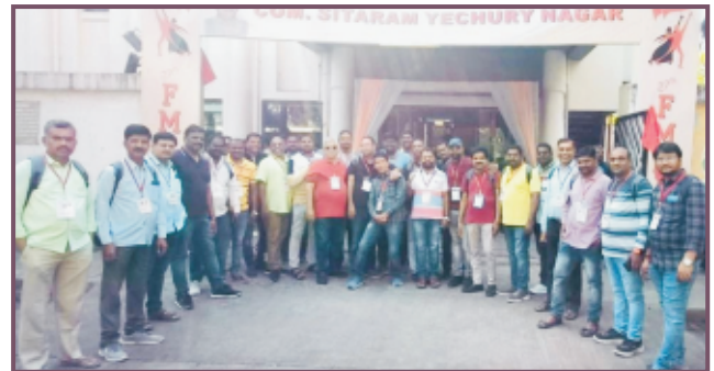
Delegates of TMSRU