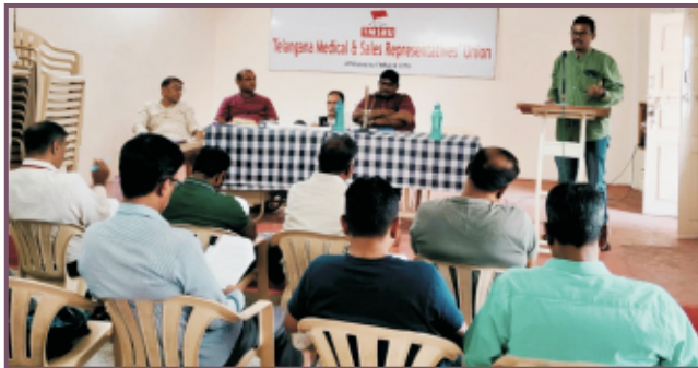
State Working Committee Meeting - Hyderabad