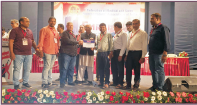
Hyderabad felicitated on achievement of 1000 Memberships 2024