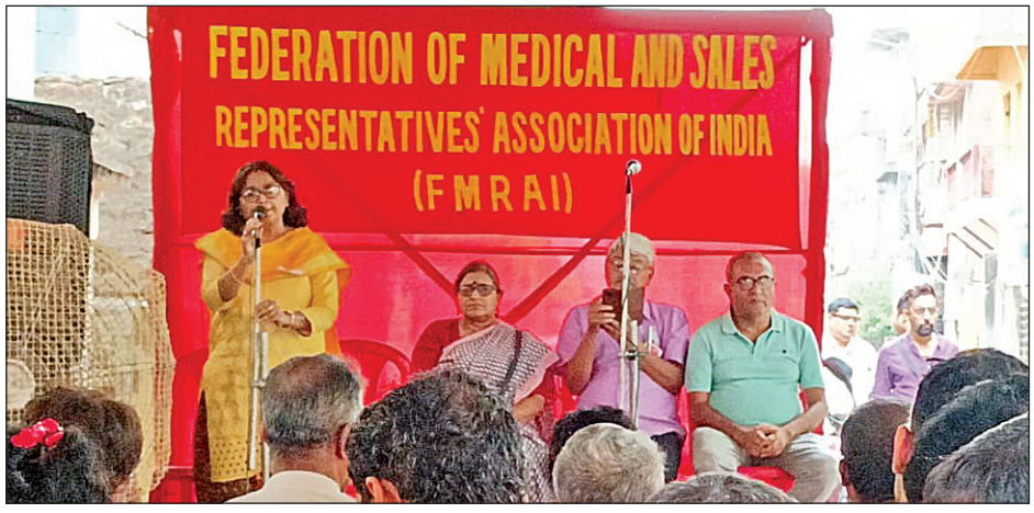
May-Day meeting at FMRAI center in Kolkata.