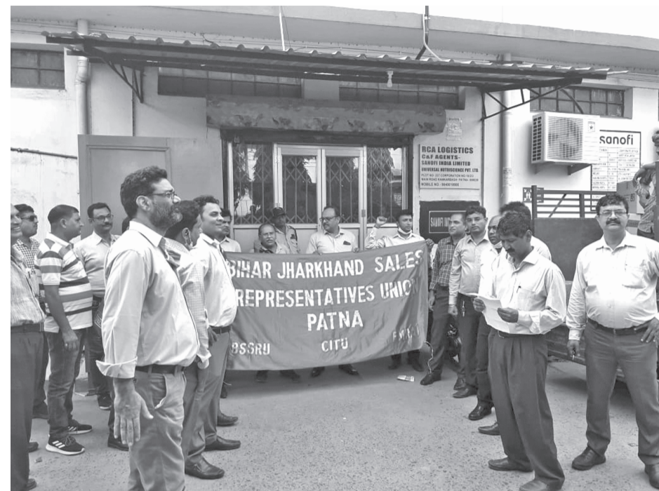
TTK demonstration at Patna, BSSRU

protests to the managers who are transferred to BSV. A delegation comprising of FMRAI, TNMSRA and CITU leaders met the Labour Secretary and Labour Commissioner, Government of Tamilnadu in Chennai and have submitted a complaint petition demanding intervention to declare the retrenchments as illegal. FMRAI is awaiting for Government action and will pursue the matter according. FMRAI Secretariat, after assessing the entire developments, decided that the illegal and unjust action of the management will be protested strongly. Accordingly, states started holding council meetings of TTK fieldworkers, either virtually or physically with both retrenched