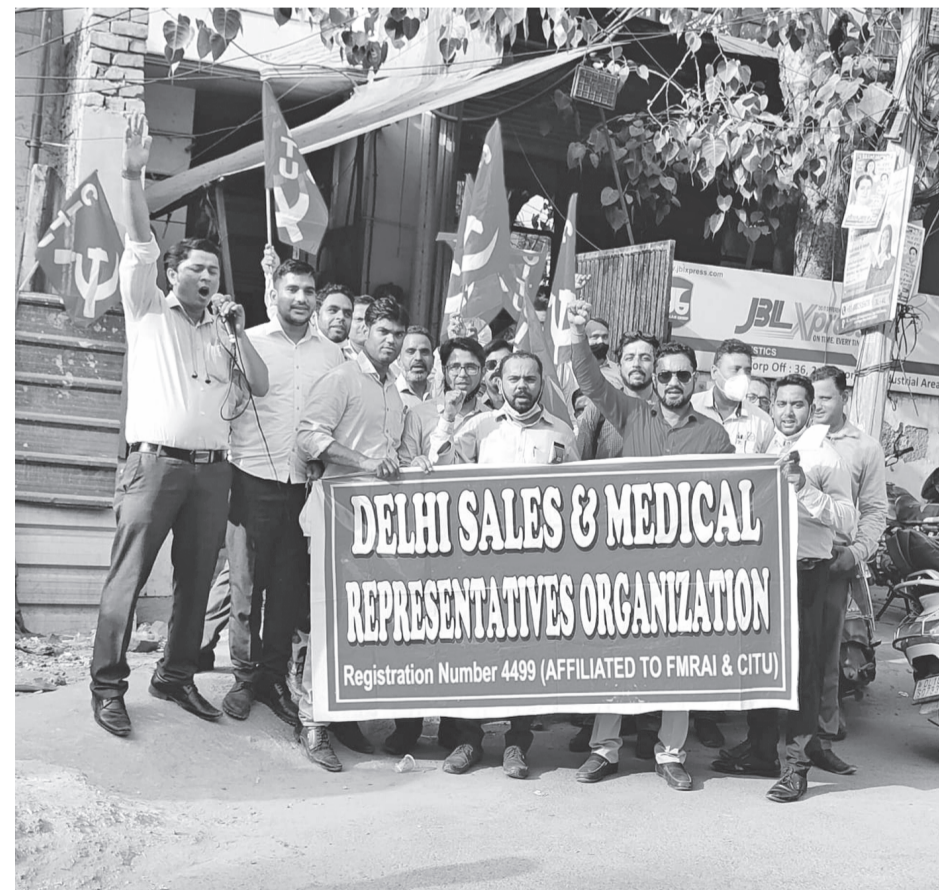
Demonstration, Albert David at Delhi, DSMRO

Out of sheer desperation and toeing the line of habitual law breaking, the rogue management of Albert David Ltd hired goons and launched attack on DSMRO