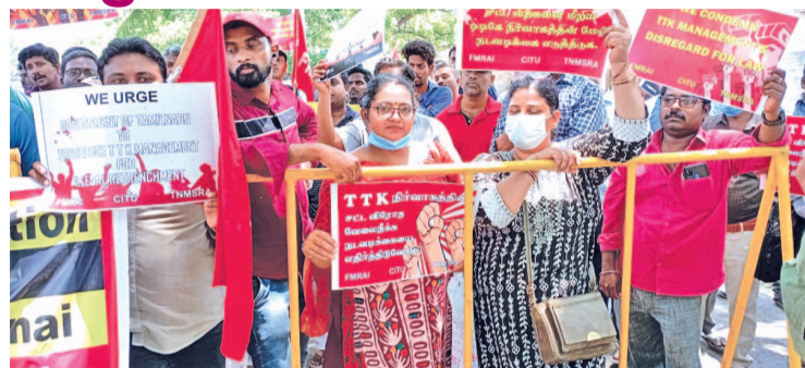
TTK head office dharna at Chennai

Creating a classic example of corporate betrayal and vengeance, the management of TTK pharma resorted to mass scale termination of sales promotion employees working in their company throughout India. The terminations came after the management announced the sale of its human pharma division to BSV and is effective on 212 field workers including leaders of the All India Council. That such an arbitrary, unlawful and repugnant task could be undertaken by the management immediately after successfully signing the 7th wage settlement with the TTK council of field workers is unprecedented and reflects the very deceptive anti-worker mindset of the management. Apart from the above, more than 352 field workers received job transfer offers from TTK to BSV. Taking illegal advantage of the situation, the management of BSV unilaterally changed the service conditions of the transferred sales promotion employees to TBM circumventing the laws of the land in an effort to remove the umbrella of protection