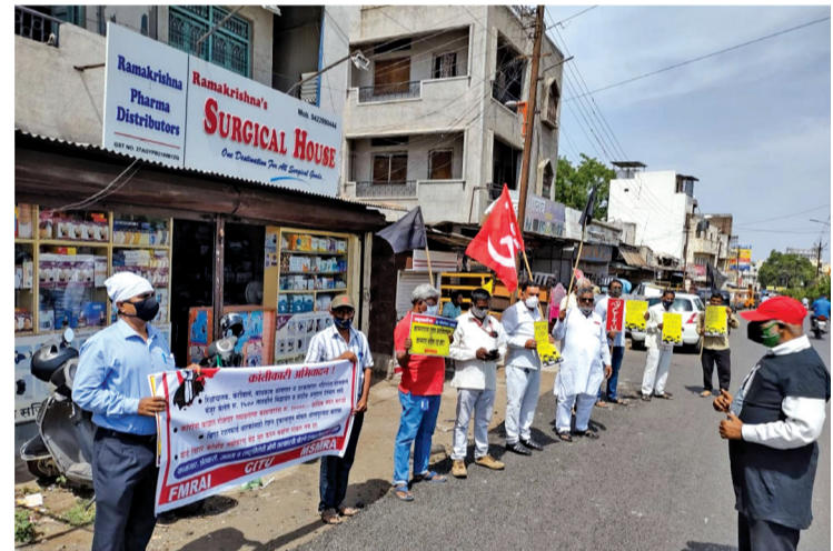
National Black Day Aurangabad, MSMRA