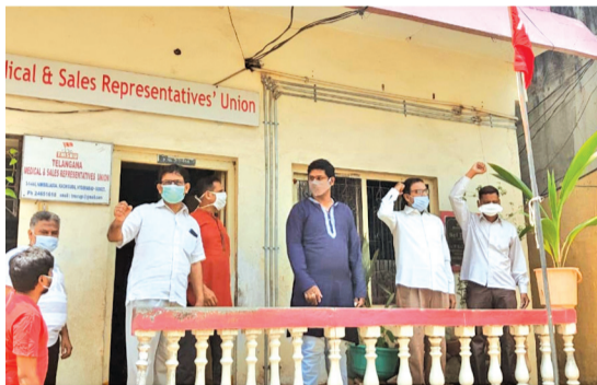
May Day, Hyderabad, TMSRU