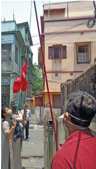
May Day, FMRAI Centre