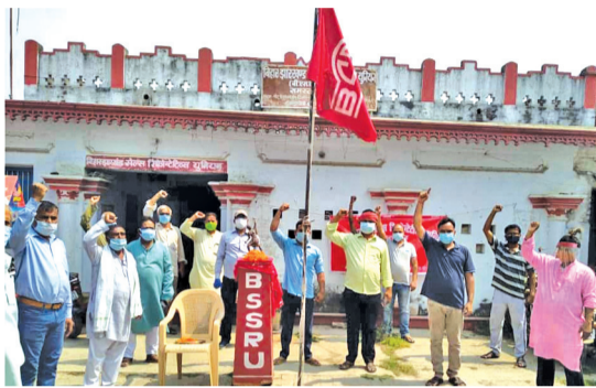
May Day, Samastipur, BSSRU