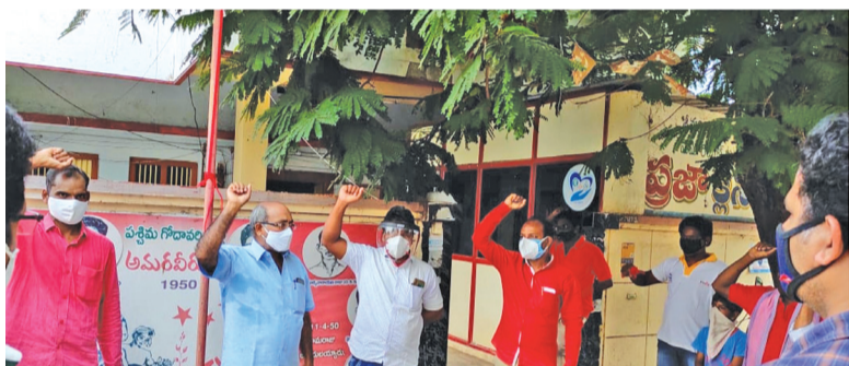
May Day, Eluru, APMSRU