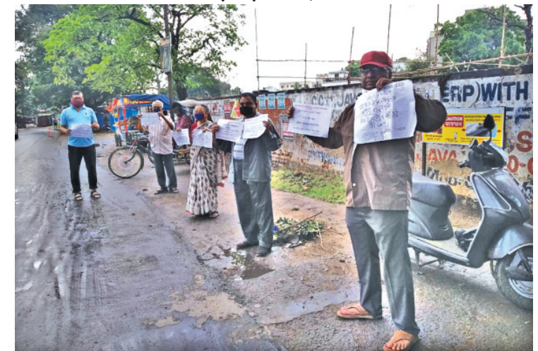
21st April protest, BSSRU