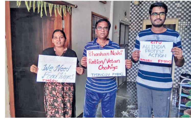
21st April protest, TMSRU