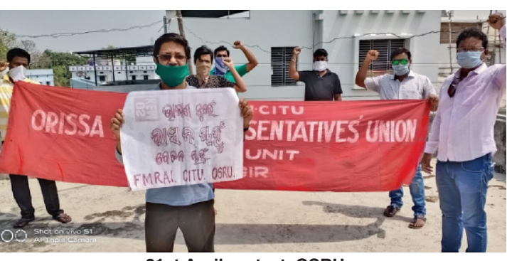
21st April protest, OSRU

21st April protest, WBMSRU FMRAI greets all members and functionaries for observing all