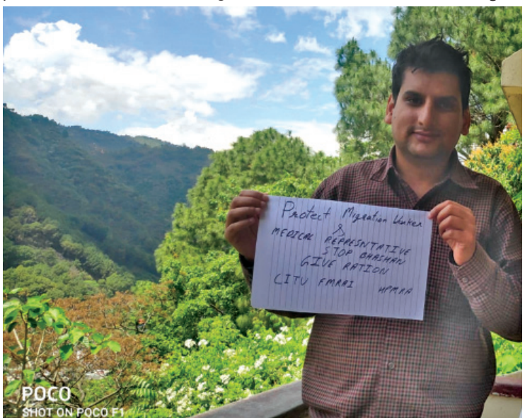
21st April protest, HPMRA

members. In some instances protesters carried union's flag, in