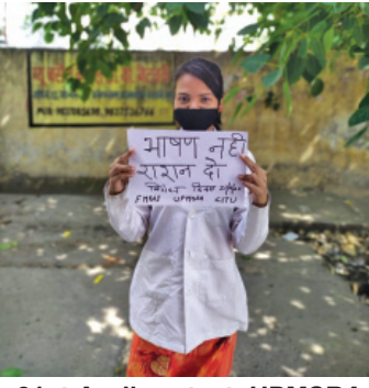
21st April protest, UPMSRA

India it was organized in Goa by Goa MRA, in Gujarat by GSMRA,