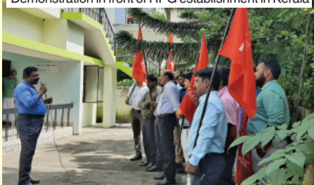
Demonstration in front of RPG establishment in Kerala

The management of RPG life Sciences is forcing the field workers to accept online appraisals. The company has not paid the bonus for the last three years. The company has not called the Welfare committee meeting during last one year. Field workers of RPG life Sciences are extremely aggrieved at such high handed acts of the management FMRAI has called upon the field workers and the state units to organize agitational