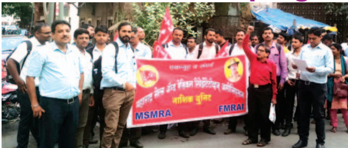
MSMRA Nashik unit submitted strike notice to district collector and organised demonstration

On 30 th September 2019 the united platform of Trade Unions and industrial federations of the country declared All India strike on 8 th January, 2020 , from the Joint Convention at Parliament Street to protest against the anti-worker, anti-people, and pro-